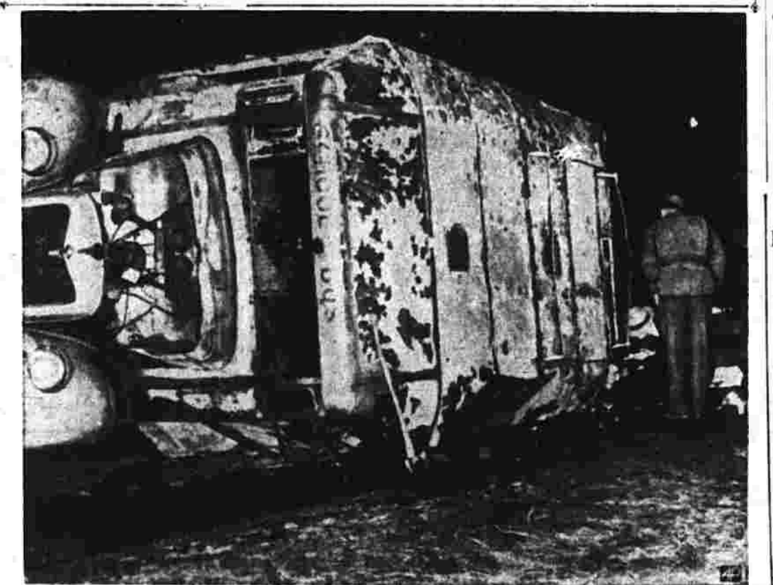
Ten youths died when this NYA bus ran off a highway near Robinson, Ill., and burst into flames. Rescue workers are shown removing bodies, which were so badly charred identification was difficult.